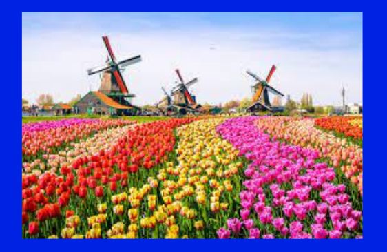
Born in NL

Innovation Attaché, NL embassy in IL (2016-) EU collaborative research projects (2004-2017) Setting up innovation cooperation and ecosystems